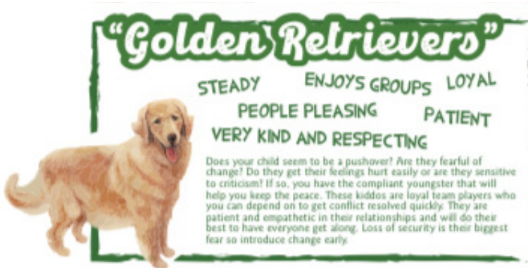
People I know who are Golden Retrievers