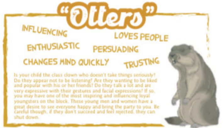
People I know who are Otters